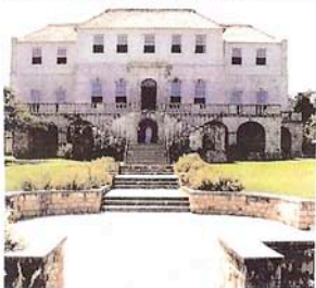
(TOP) HOLE NO. 17 ON THE WHITE WITCH IN MONTEGO BAY; (ABOVE) THE (HAUNTED) GREAT HOUSE.