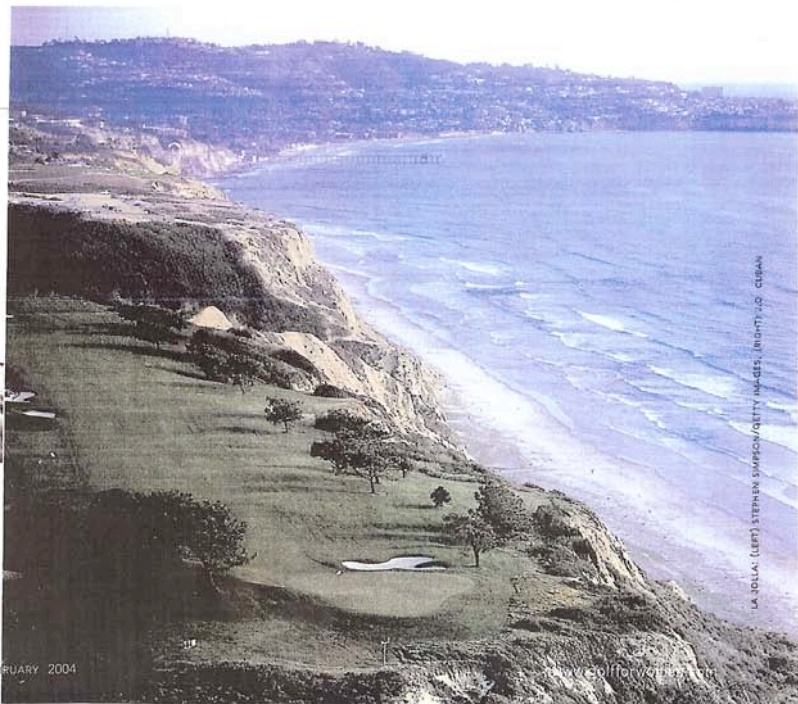
LA JOLLA